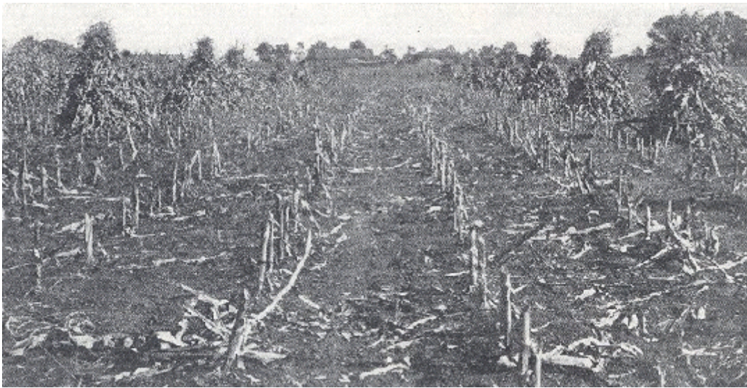
Fig. 1. High Stubble Leaves Many Borers.

Corn borers spend the winter in corn stalks. It is difficult to find the pests in other plants except weeds growing in heavily infested corn fields.