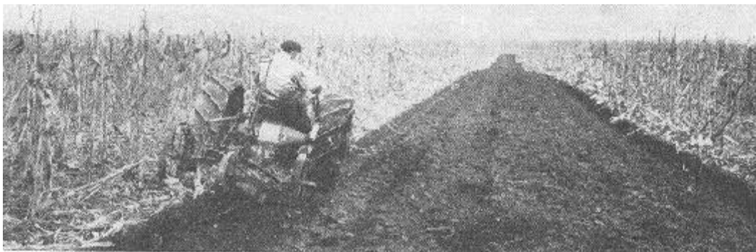
Fig. 3. Wide Bottoms Plow Whole Stalks Cleanly.

A plowed field must be free from surface refuse to kill the borers. Fall plowing when possible is desirable. All control work should be completed by June 1.