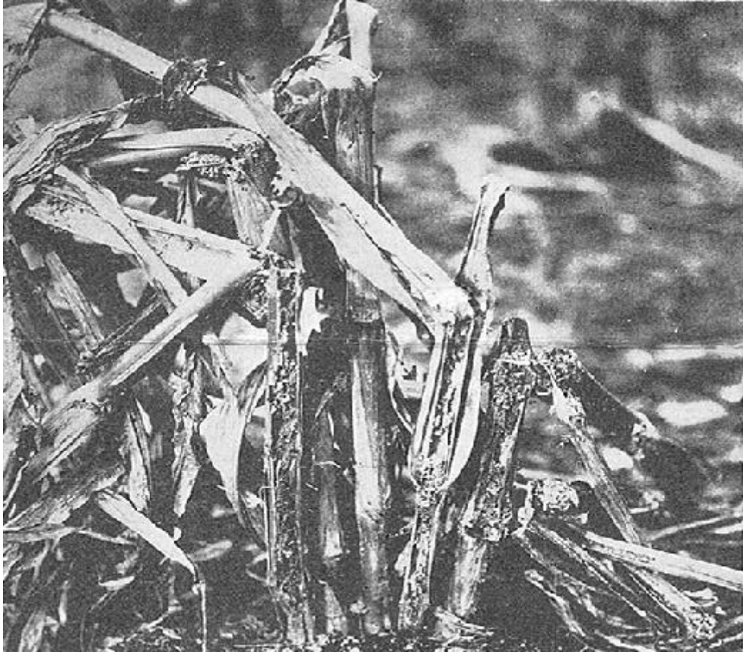
Fig. 4. Borer Damaged Corn.