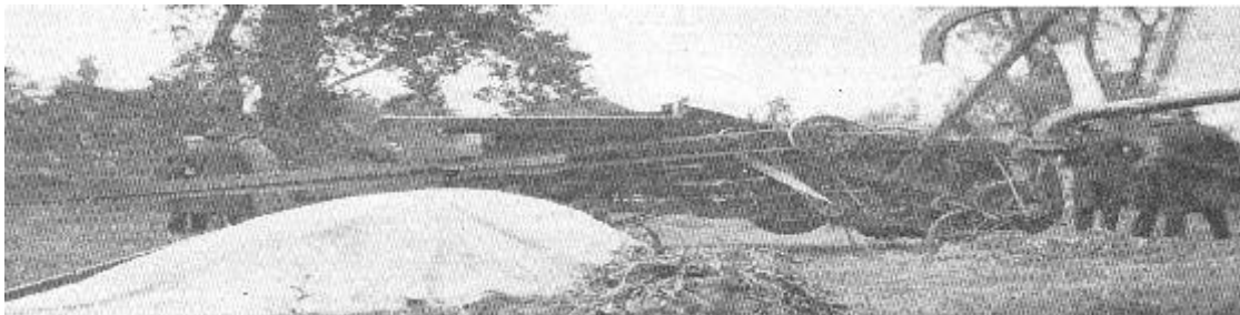
Fig. 2. Well Shredded Fodder Is Safe.

This practice combines with the weather and natural corn borer enemies such as insects, parasites, birds, and other animals to hold the borer in check and permit- successful corn growing in Michigan.