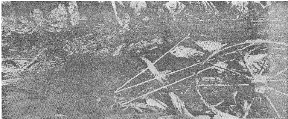
Wide base wheel plow equipped with wires for turning under stalks.

A length of evener and line adjustment should be used which will permit each horse to pull straight ahead. For two horses, a 38 inch evener is about right with a 14 inch plow. Where three horses are used with one horse in the furrow, singletrees 27 to 28 inches long should be used. Where the gauge wheel is used on the plow, get the plow in adjustment without the wheel, set wheel, and raise vertical hitch one hole. The tugs should be at right angles to the hames with little or no pull on the hip straps or backhand. With harness adjusted, the vertical hitch in the plow controls the depth and the horizontal hitch controls the width of cut.