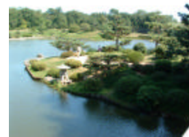
Japanese Gardens at Chicago Botanical Gardens

I'm of oriental heritage And look like my Western cousin My blooms consist of large tear-shaped bracts Surrounded by heads of fertile florets. I cling!, I cling!, and therefore I am!