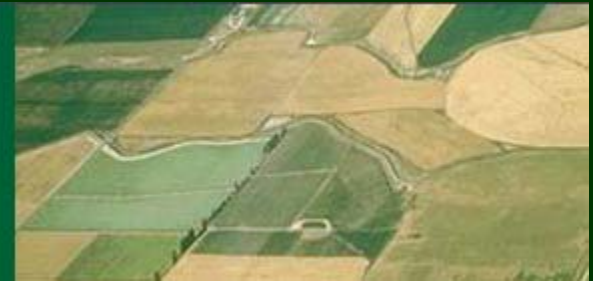
Innovative Program Award to the authors of Citizen Planner

A land use training and certificate program for volunteer land use decision-makers.